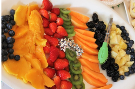
Wow what a Platter

Last Saturday 3rd December was the Christmas Party with visitors coming from different parts of Sydney and one Member brought her daughter up from Thirlmere. Everyone brought a plate of goodies. The food was delicious, thank you all.