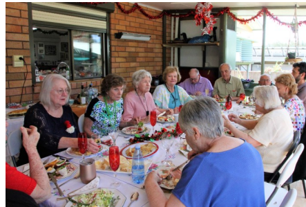
Happy Revellers 2