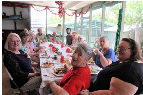
The Happy Revellers