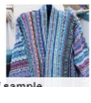
6% of sample